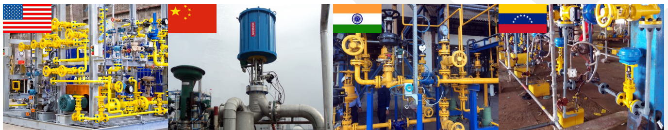
Liquid Chlorine Pump Skid. Bellows Seal Manual Valves.