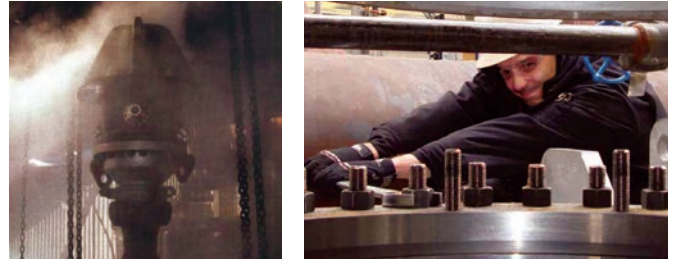
Bottom Unheading Valve Install

DeltaValve's network of experienced technicians and engineers are on call to respond to any customer needs, anytime, anywhere. Our team of technical experts has quick access to all equipment drawings, bills of material and customer specifications. This information provides DeltaValve the unique capability to evaluate and troubleshoot issues and provide solutions in a timely and practical manner. Whether it's routine maintenance, or a major equipment turnaround, DeltaValve is your trained source for aftermarket and turnaround services.