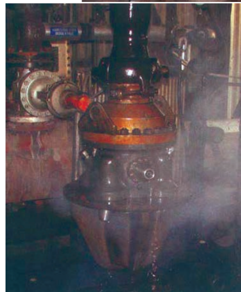
Auto Switch Coke Cutting Tool